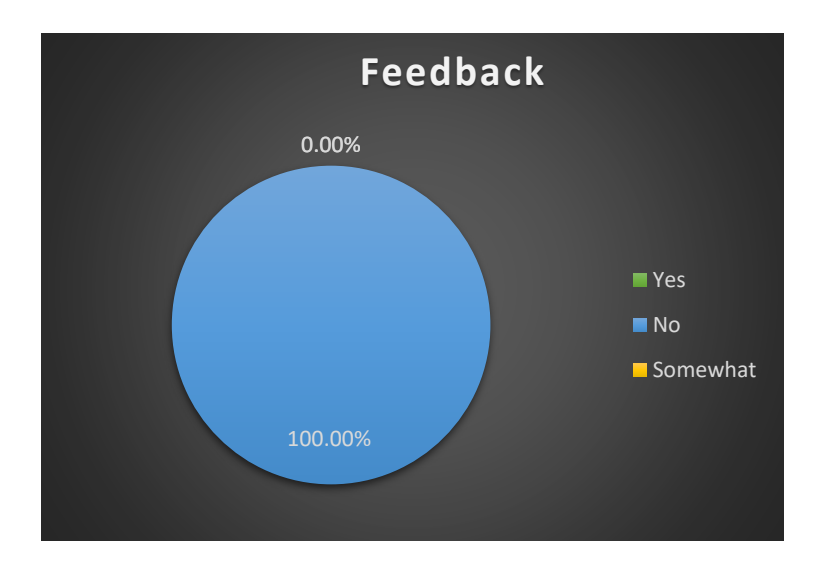
Q4>When do you get information relating to the college?